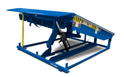
U-Beam Mechanical Dock Leveler

With innovative features such as U-beam deck support and a highly efficient ratchet hold-down system, the Blue Giant U-Beam mechanical dock leveler has an industry-wide reputation for quality and performance.